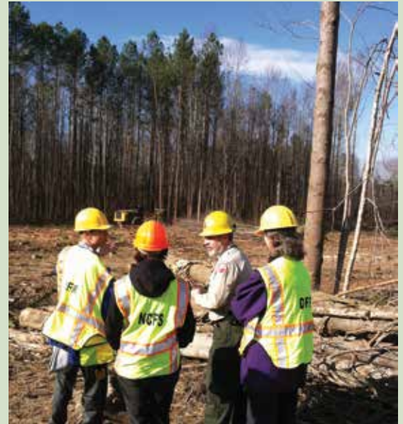
A tour of logging on Clemmons Educational State Forest for DENR staff.

Photo provided by the North Carolina Forestry Association.