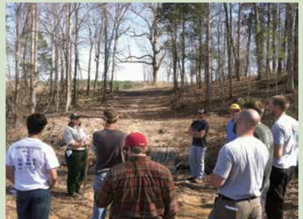
College students get a lesson on proper BMPs and soil stabilization measures after logging is completed.