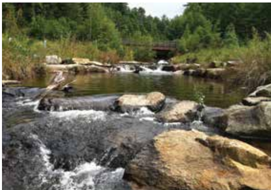
The Lake Julia Outfall (Reasonover Creek) at DuPont State Recreational Forest, Sept. 2014. Additional trees were installed this past year to fill in gaps