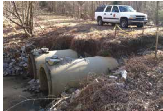
Washed out culverts in Beddingfield Creek on Clemmons Educational State Forest, Jan. 2014. We are seeking grant funds to restore this stream section and install a better crossing.